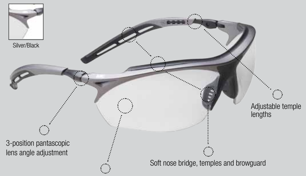
Polycarbonate lens absorbs 99.9% UV

Maxim GT brings sophistication, style and comfort to protective eyewear. Features include a lightweight frame with an elastomeric browguard for added comfort, and a high-wrap lens for better coverage and good optical clarity. The dual-injected adjustable temples with 3-position lens adjustment helps wearers get the best possible fit for day-long comfort.